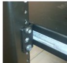
Figure 1b: Rack installation

See Figure 2a and Figure 2b for an illustration of the mounting hardware configured for a cabinet installation.