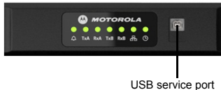
Figure 4: Front panel

The SLR 5000 Series Repeater connector to facilitate the CPS configuration is a USB Type-B host connection located on the front of the repeater. See Figure 4.