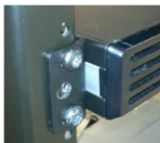
Figure 2a: Mounting hardware Figure 2b: Mounting hardware